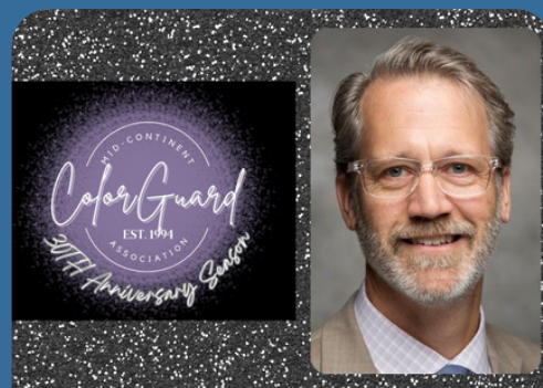
Hall of Honor - Class of 2024

READ THEIR FULL BIOS ON THE MCCGA WEBSITE