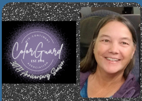
Hall of Honor - Class of 2024