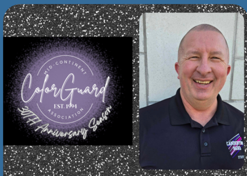
Hall of Honor - Class of 2024