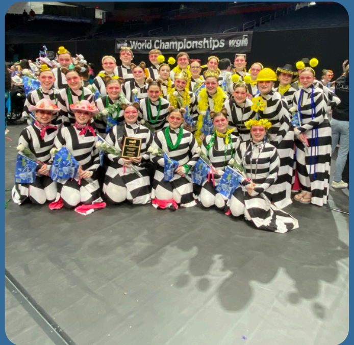
NATIONAL AVENUE INDEPENDENT A FINALIST