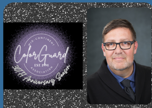
Hall of Honor - Class of 2024