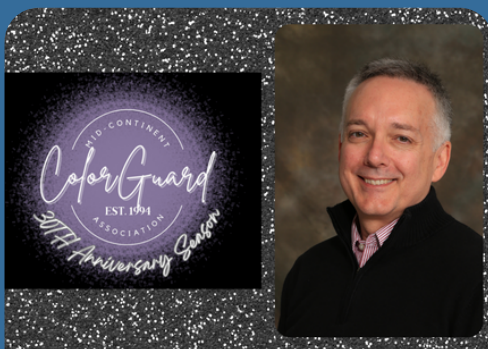
Hall of Honor - Class of 2024