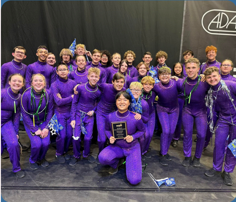
KICKAPOO PERCUSSION SCHOLASTIC A FINALIST