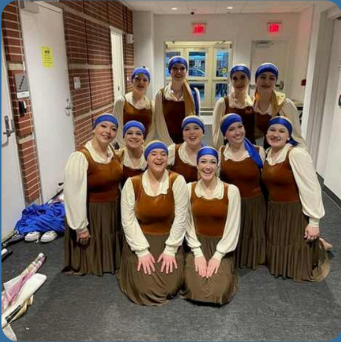
BLUE SPRINGS SOUTH SCHOLASTIC A FINALIST