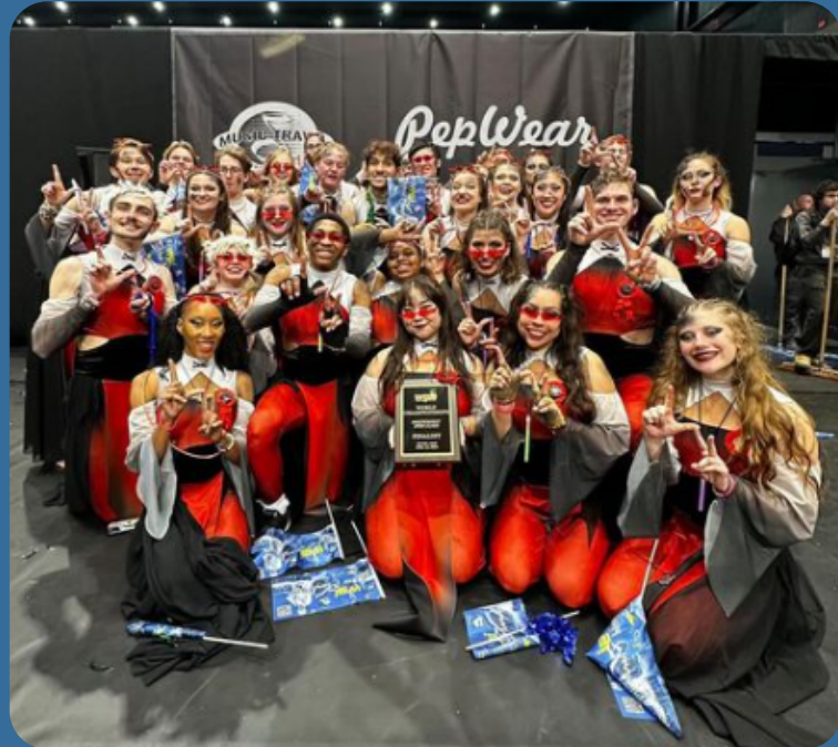
LA VOUTE PERFORMANCE ENSEMBLE INDEPENDENT OPEN FINALIST